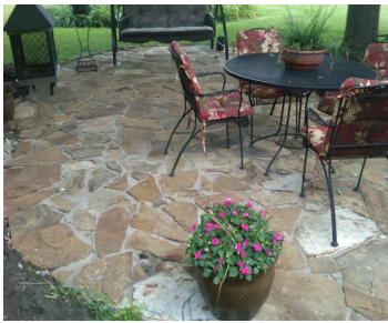
Natural Flagstone Patios