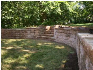
Natural and Modular Retaining Walls